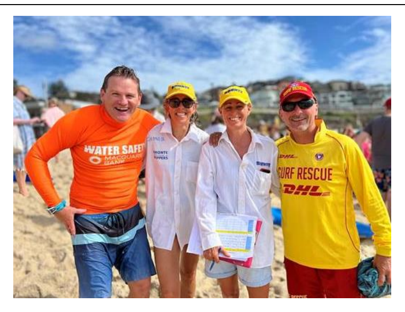
No Water Safety parents = no water activities