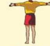
3. Remain stationary