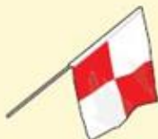
16. Emergency evacuation flag