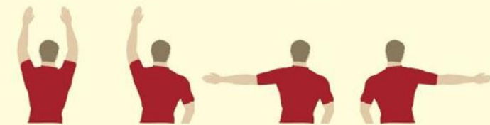
5 Proceed away from shore