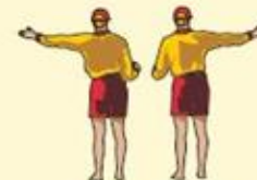
8. Go to the left or the right