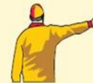
19. Helicopter signal—request to enter