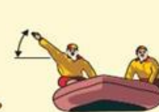
12. Boat wishes to return to shore