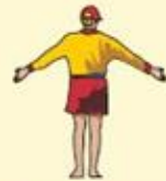
6. Investigate submerged object