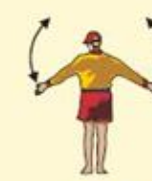
10. Pick up or adjust buoys