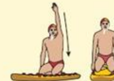
14. Shore signal received and understood