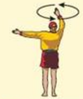
5. Pick up swimmers