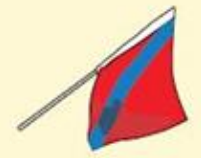
20. Signal flag