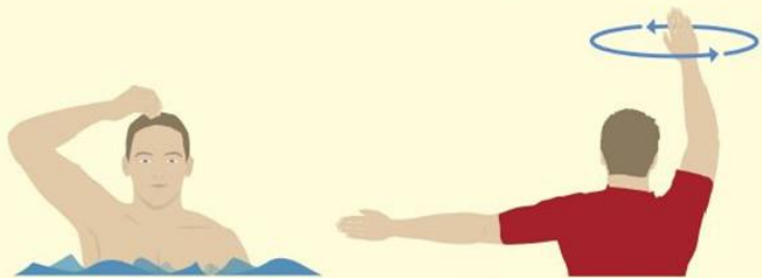
3 All clear/okay