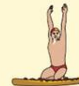
13. Emergency evacuation alarm