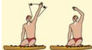
11. Assistance required

(May be conducted from any craft or boat)